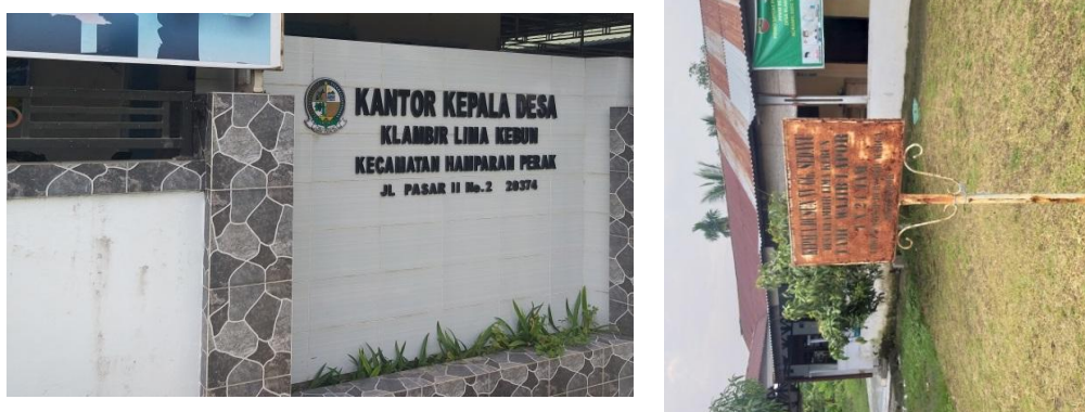
Figure 1. Klambir Lima Kebun Village

Klambir Lima Kebun Village is one of the villages located in Hamparan Perak District, Deli Serdang Regency, North Sumatra Province. Administratively, the village's location is situated on the border of Medan City and the Deli Serdang Regency. The number of Klambir Lima Kebun village residents is recorded at \pm 18,000 people (Survey, 2021), which has an area of 2,323 Ha. Klambir Lima Kebun Village has XXI (twenty-one) hamlets and \pm 7,000 family heads (KK). About 75% of the population is livelihoods as factory workers, and settlements are located in plantation and factory areas that border municipalities and regencies.