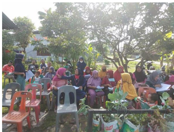
Figure 2. The Household Business at Klambir Lima Kebun Village